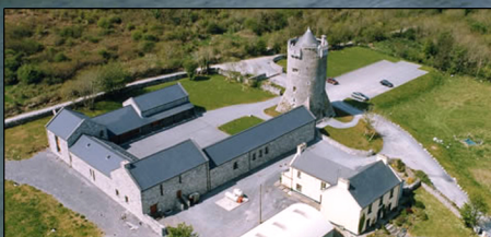
Burren College of Art http://www.burrencollege.ie/